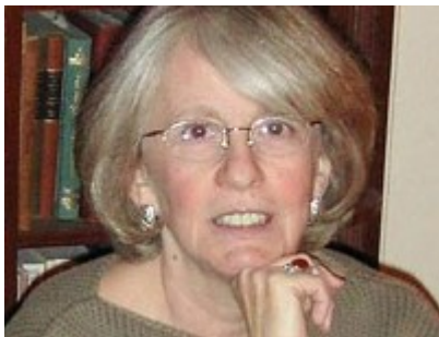
Her Jew BS has made her a nice bundle.

For that matter, just think how many relationships and lives he ruined in the US with the evils of his Jewish “liberation” philosophies in the sixties and since then? Give that some thought!