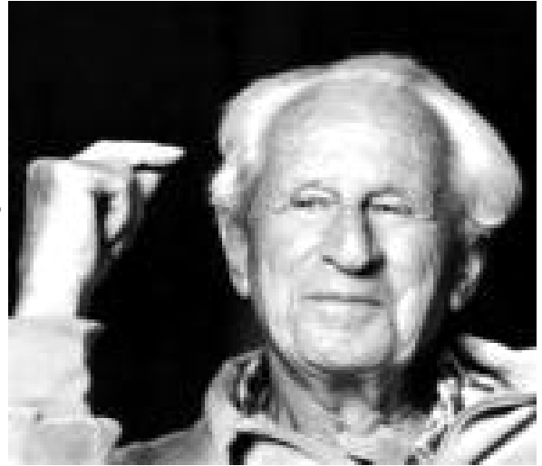
This Jew was all over the place back in the 1960s.

As seen in the videos, the Marxist Jew Herbert Marcuse (right), was welcomed into this country from Nazi Germany, but later turned around and stabbed America in the back with his subversive social theories. He created much of the victim group mentality politics and was highly influential with the “intelligentsia” of the sixties Baby Boomer Generation. All this was touted as “liberation” but in fact, was really an undermining, subversive program against non-Jewish White people that is still going on today.