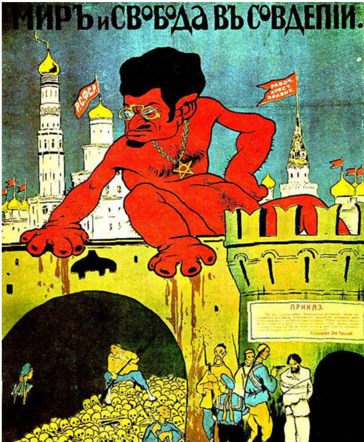
White Russian (pro-Czarist) poster depicting the Red Bolshevik, Leon Trotsky (Jewish name Lev Davidovich Bronstein). Trotsky is most often credited, with good reason, with coining the term "racist" as a derogatory term for his political enemies: White, non-Jewish Gentiles. Note the Christian cross broken in the upper left and the White Russian being threatened by