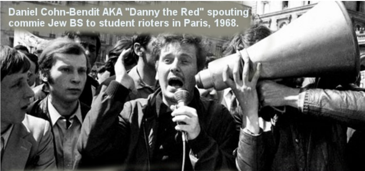
He was the french "Abbie Hoffman" (another money-making rabble-rouser Jew afflicting the US at the time).