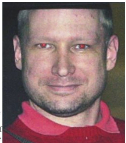
Anders Breivik, well-known as a big time Zionist/pro-Israel Freemason, who’s murderous rampage on a