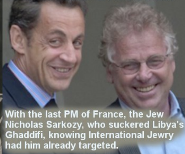
With the last PM of France, the Jew Nicholas Sarkozy, who suckered Libya's Ghaddafi, knowing International Jewry had him already targeted.