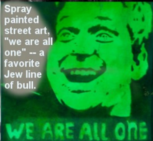
Spray painted street art, "we are all one" -- a favorite Jew line of bull.