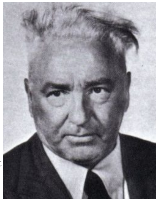
Wilhelm Reich. Like so many commie Jews in pre-Hitler Germany and Austria, this tripped-out pseudo-scientist escaped to the US to continue his bizarre psycho-sexual obsessions.

The impetus of The Authoritarian Personality was the Holocaust, the attempted genocidal extinction of European Jews by Adolf Hitler’s National Socialist party. Adorno had been a member of the “Frankfurt School”, a predominantly Jewish group of philosophers and Marxist theorists who fled Germany when Hitler shut down their Institute for Social Research. Adorno et al. were thus motivated by a desire to identify and measure factors that were believed to contribute to antisemitic and fascist traits.