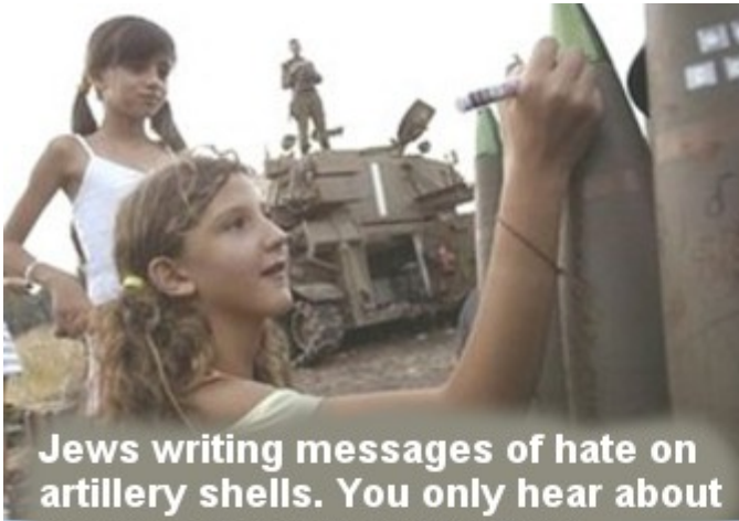
Jews writing messages of hate on artillery shells. You only hear about Iranians doing crap like this!