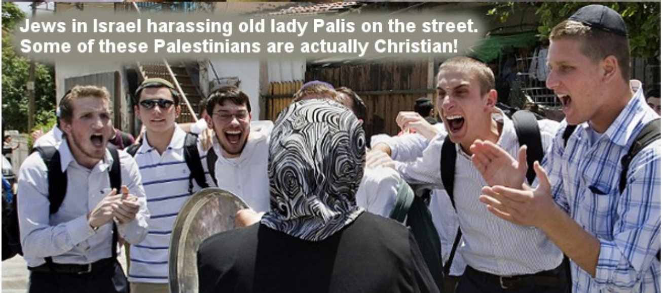
Jews in Israel harassing old lady Pali on the street. Some of these Palestinians are actually Christian!

Most Americans are clueless of what goes on over there, since the bastards control our media over here. Jews have treated the Palestinians like dogs from day-one. Say one thing, and the hypocrites call you the big Nazi! Trouble is, American Whites have been totally brainwashed