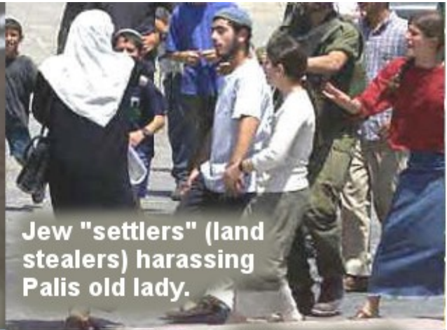
Jew "settlers" (land stealers) harassing Pali's old lady.