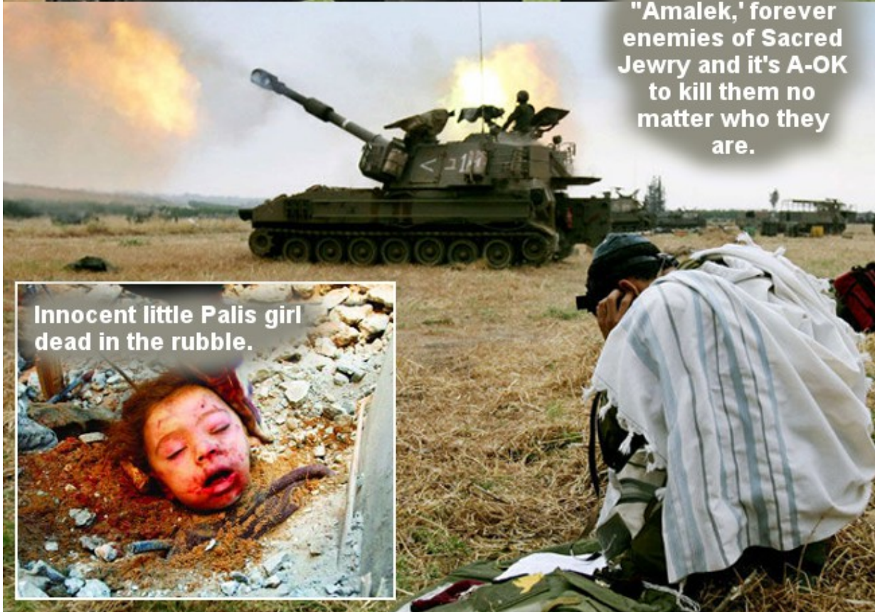
Jew rabbis enjoying the show. They believe non-Jews belong to "Amalek," forever enemies of Sacred Jewry and it's A-OK to kill them no matter who they are.