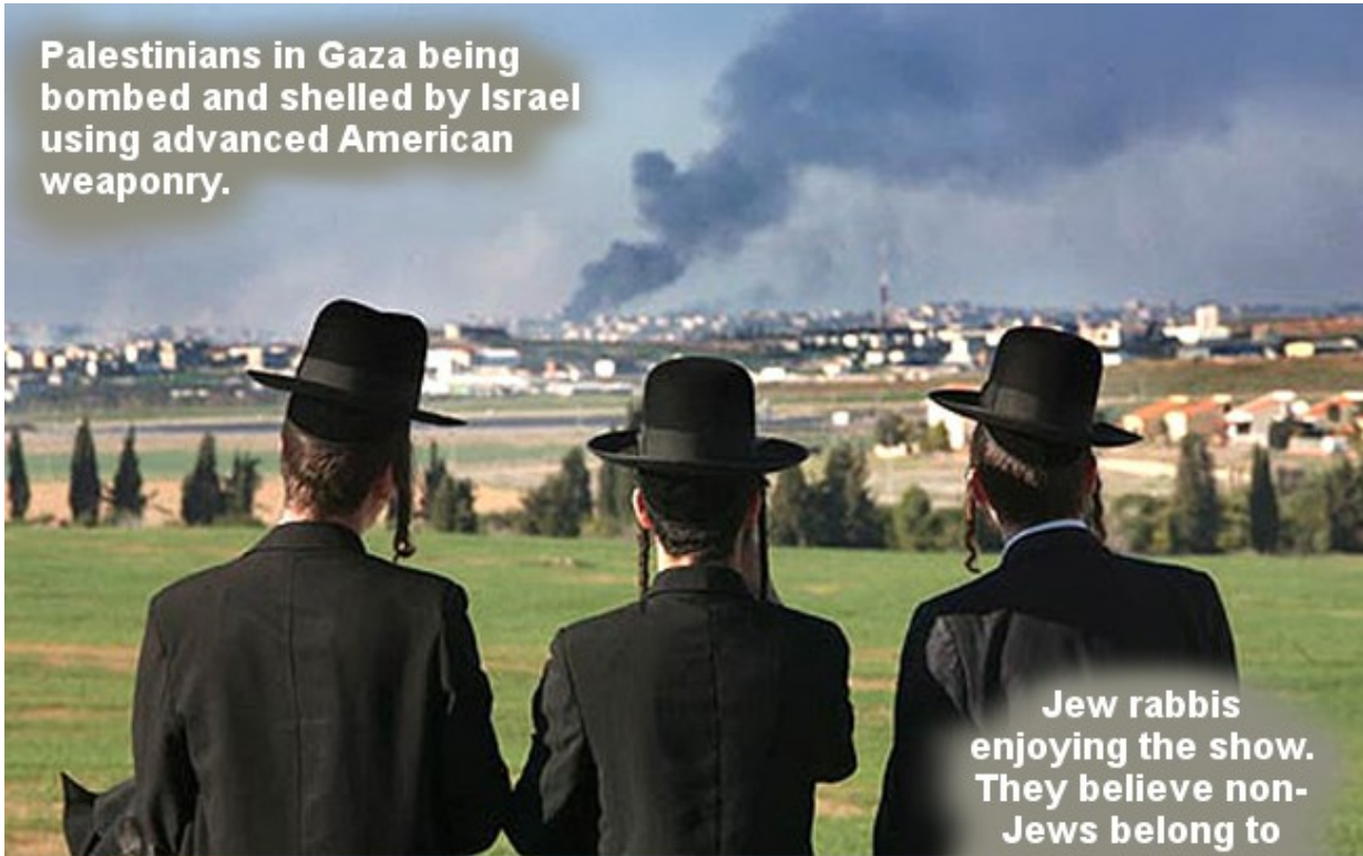
Palestinians in Gaza being bombed and shelled by Israel using advanced American weaponry.