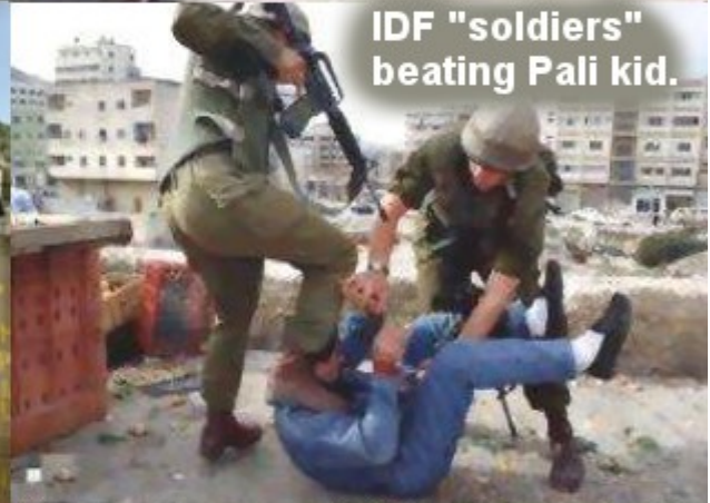
IDF "soldiers" beating Pali kid.