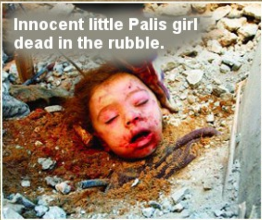
Innocent little Palis girl dead in the rubble.