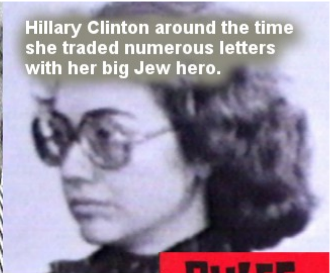
Hillary Clinton around the time she traded numerous letters with her big Jew hero.

Lest we forget at least an over-the-shoulder acknowledgment to the very first radical: from all our legends, mythology, and history (and who is to know where mythology leaves off and history begins—or which is which), the first radical known to man who rebelled against the establishment and did it so effectively that he at least won his own kingdom —Lucifer.