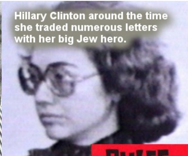
Hillary Clinton around the time she traded numerous letters with her big Jew hero.

Lest we forget at least an over-the-shoulder acknowledgment to the very first radical: from all our legends, mythology, and history (and who is to know where mythology leaves off and history begins—or which is which), the first radical known to man who rebelled against the establishment and did it so effectively that he at least won his own kingdom —Lucifer.