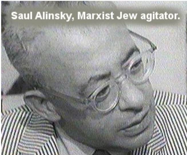
Saul Alinsky, Marxist Jew agitator.