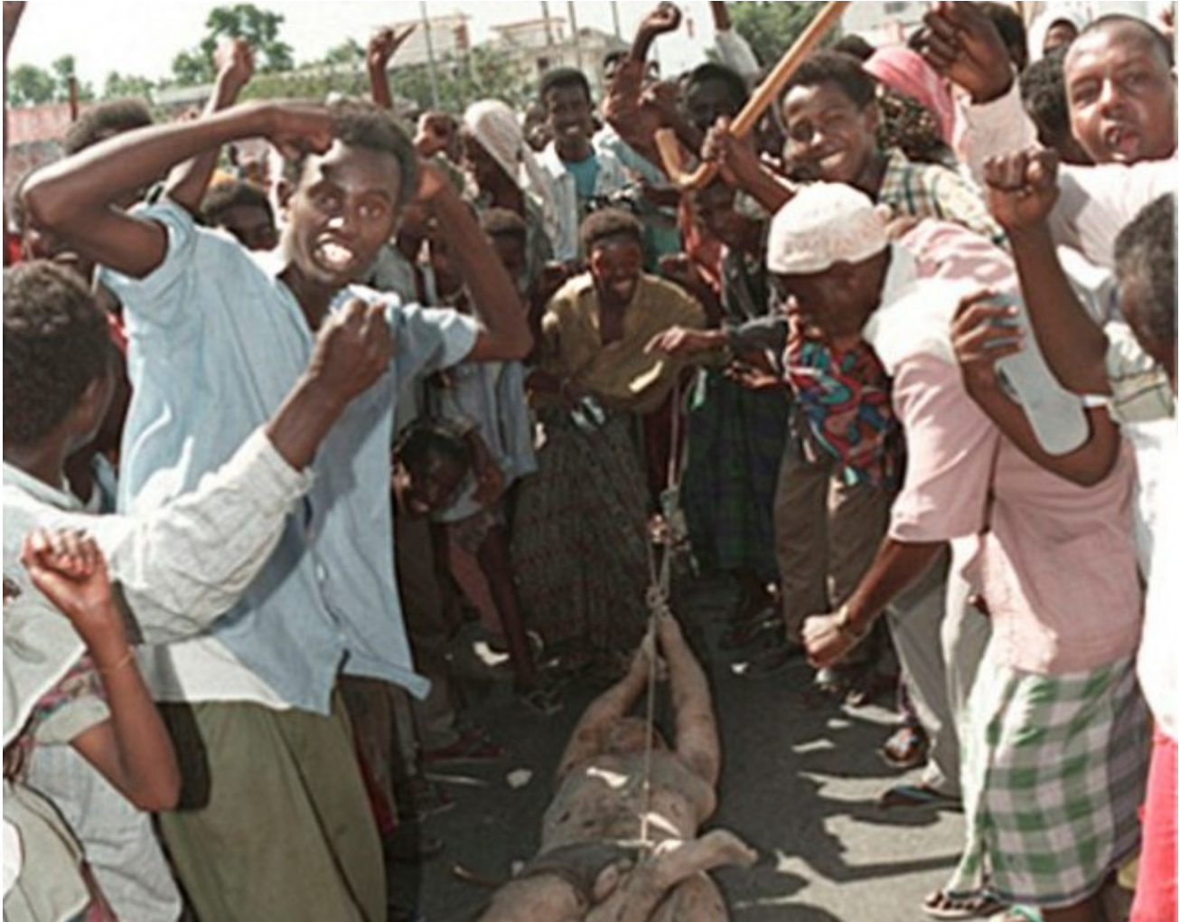
Excited jiggaboos drag a White dead US soldier's body through the streets of Mogadishu, Somalia in 1993. After all the help we give to these stinking ungrateful bastards!