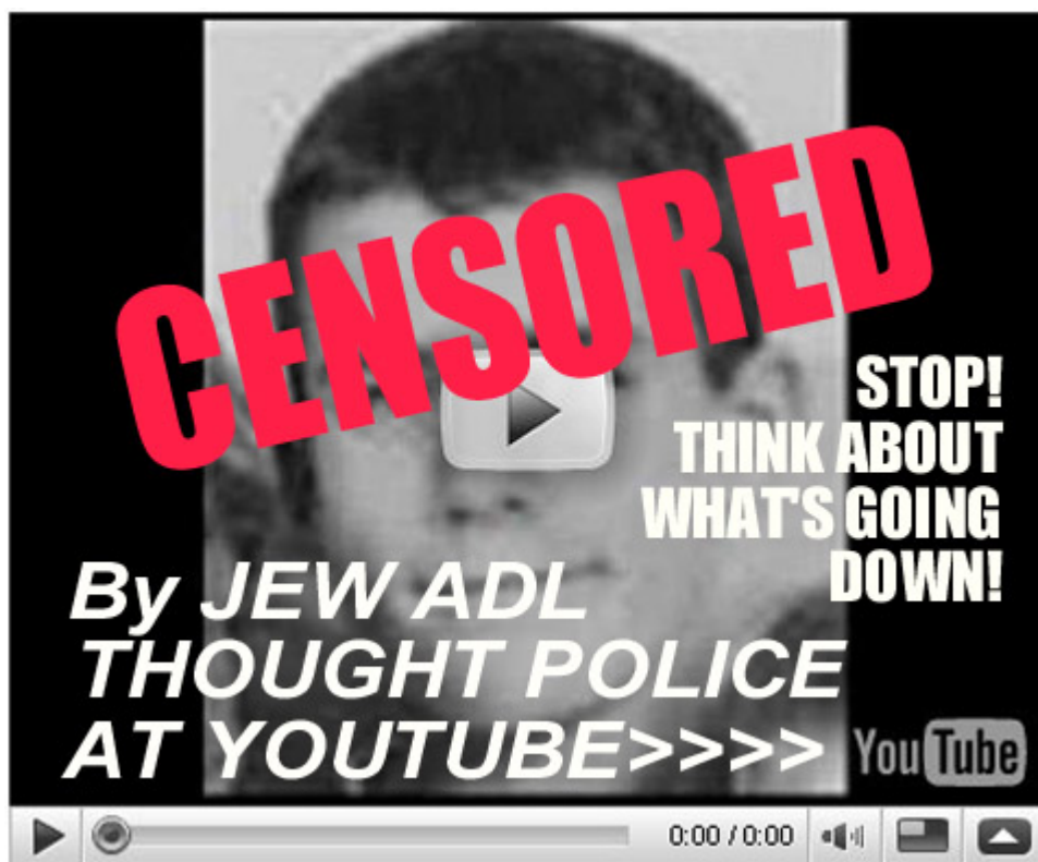
Ghandi on Hitler and the Jews.

WOW! Youtube took this out? I guess the stinking Jews just can't have people know what "Mr. Peace" Ghandi said about them.