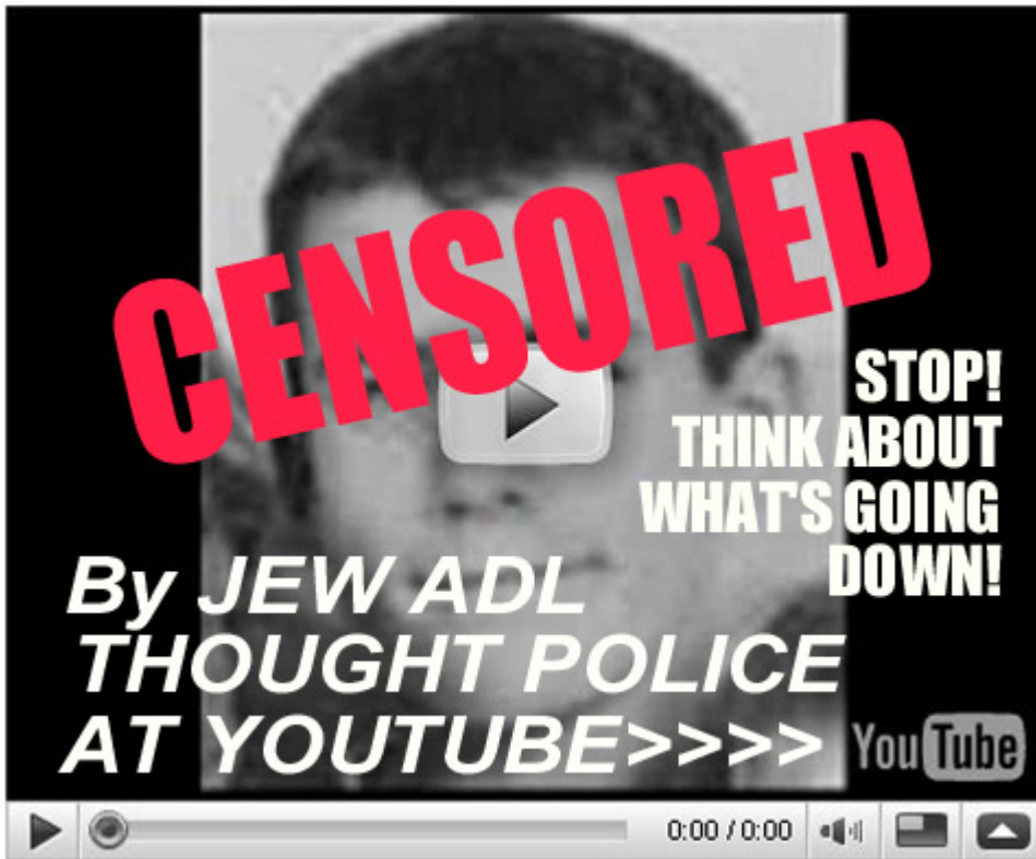
Ghandi on Hitler and the Jews.

WOW! Youtube took this out? I guess the stinking Jews just can't have people know what "Mr. Peace" Ghandi said about them.