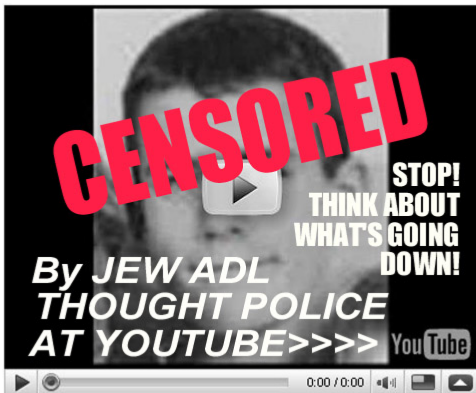
Anti-gun people can NOT defeat this video