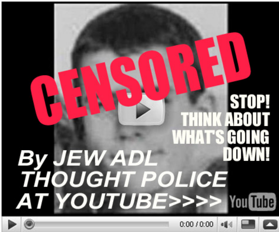
“A Declaration of War” - From the Youth of France - (English subs). The bastards got this one taken down, too.

Crazy Obama byatch be protestin’ Romney an’ sheet.