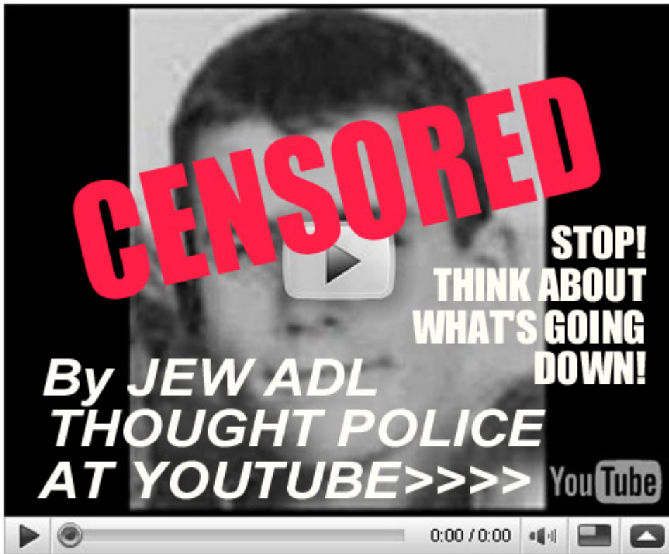
Why Feminism is Genocide ~ Dr. William Pierce